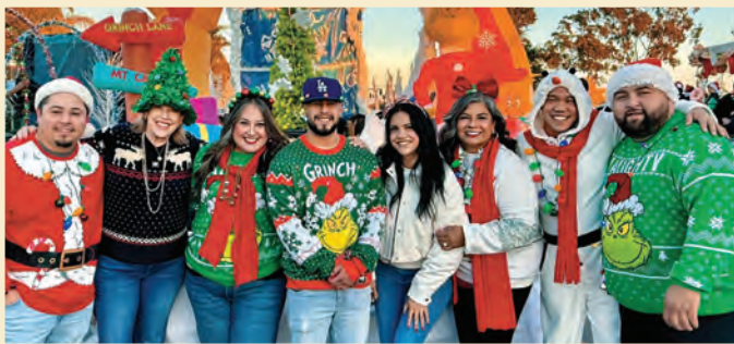
The SESLOC team shared holiday cheer at the annual Santa Maria Parade of Lights.