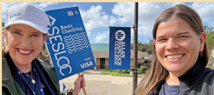
SESLOC was on the scene at the Allan Hancock College "Spring Bow-Wow" student orientation event to answer questions about budgeting and help new students get a head-start on their banking needs.