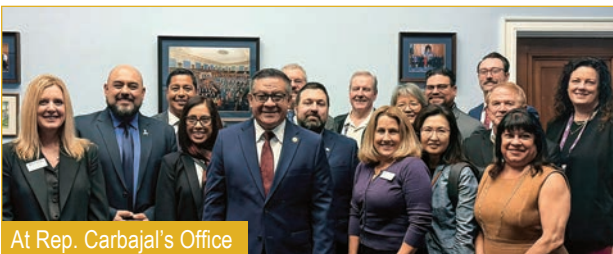
At Rep. Carbajal's Office

In the month of March, SESLOC Board of Directors and Senior Management had the opportunity to visit U.S. Representatives Salud Carbajal and Jimmy Panetta at the U.S. Capital Building in Washington, D.C., along with leadership from other credit unions in our district. Together, we advocated for modernizing federal standards for fraud prevention, protecting the credit union tax exempt status, and expanding access to credit unions so more people and businesses can benefit from our not-for-profit cooperation.