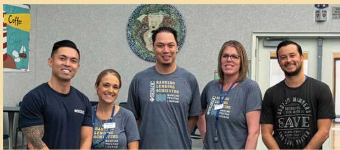
Students at Paloma Creek High School got a "Bite of Reality" with a hands-on budgeting simulation presented by SESLOC. Students were given a unique scenario, including a job, family and expenses, and worked through stations to create a balanced budget.