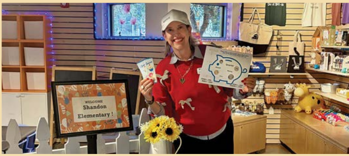
Students from local elementary schools enjoyed fun evenings for free at the San Luis Obispo Children's Museum, sponsored by SESLOC.