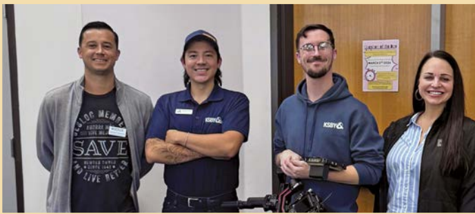
SESLOC teamed up with KSBY to ask college students about financial wellness. Tune in to the newscast on Tuesdays to see their answers.