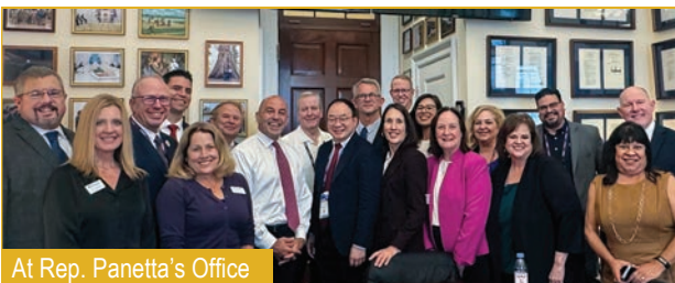
At Rep. Panetta's Office