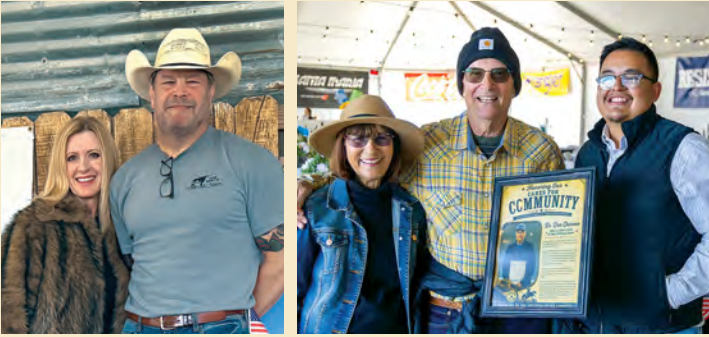
SESLOC honored local Cares for Community and Young Change Maker trailblazers at the Santa Maria Elks Rodeo Xtreme Bulls Night.