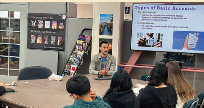
We introduced Lopez High School students to the basics of money management.