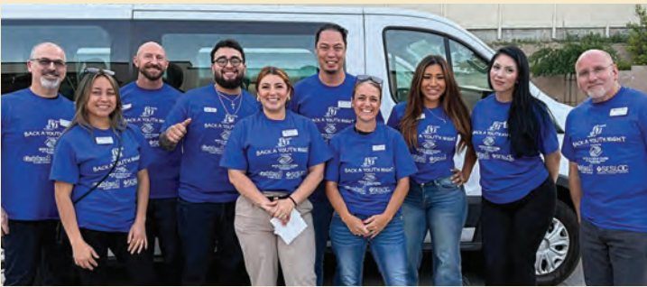
SESLOC team members mentored the next generation at the Boys & Girls Club of the Mid-Central Coast Back-a-Youth Night events in Paso Robles and Guadalupe.